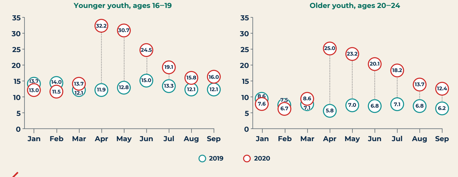
Figure 2. Monthly unemployment rate (%) among younger and older youth, 2019–2020

In September 2020, with schools opening either virtually or in person, the number of unemployed youth declined relative to the start of the pandemic. However, compared to this time last year, unemployment remains higher among older youth than among younger youth. Unemployment among older youth is twice as high as the rate a year ago (12.4 percent as opposed to 6.2 percent). The unemployment rate among younger youth declined to 16.0 percent, around 30 percent higher than the rate the same month a year ago (12.1 percent). The discrepancy in recovery patterns in unemployment may in part be due to a decline in undergraduate enrollment among collegeaged youth (ages 20 to 24) compared to last year, whereas younger youth (ages 16 to 19) are more likely to have returned to school.